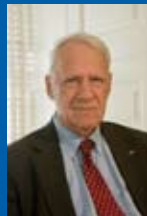
Dr. James R. Schlesinger Chairman, Mitre Corporation, Former US Energy Secretary