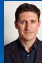
Eamon Ryan TD Minister for Communications, Energy, & Natural Resources