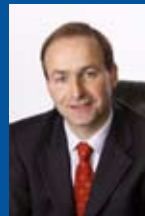
Micheál Martin TD Minister for Enterprise, Trade, & Employment